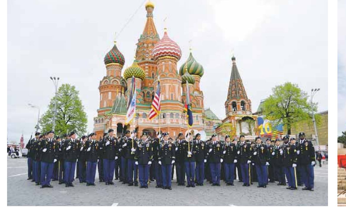
Soldiers of 18th Infantry Regiment in front of St. Basil's Cathedral in Moscow.