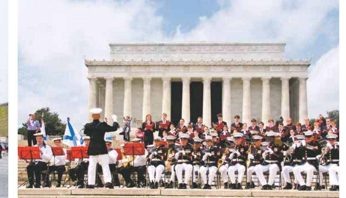
U.S. and Russian Navy Bands perform at the Lincoln Memorial to celebrate the 65th Anniversary of the Elbe River Linkage.